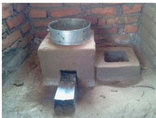
Figure 1 below shows TLC Rocket Stove, the ICS to be implemented under this SSC-CPA.

The SSC-CPA will be coordinated by C-Quest Capital LLC (CQC). ICS will be sold on a commercial basis. Carbon finance will be used to facilitate the purchase, distribution and marketing of stoves, without which the activities would not take place.